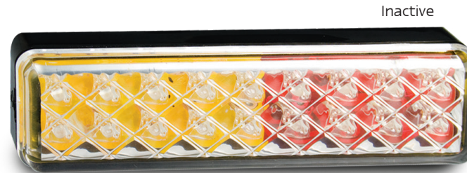
Stop/Tail/Indicator - Surface Mount 135ARM/2 - Twin Blister

Approvals Function Category CTA ADR Stop/Tail 49/00 060215 ADR Indicator 6/00 2a 060215